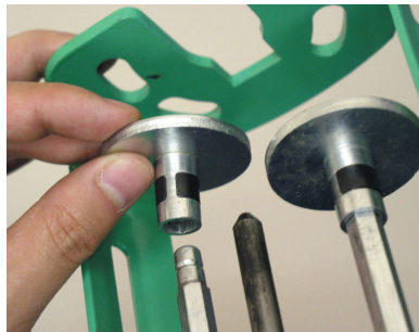
Patented Snap In/Snap Out Push Disks